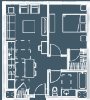
1 Bed/1 Bath, 555 sqft