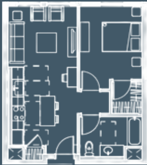
1 Bed/1 Bath, 555 sqft