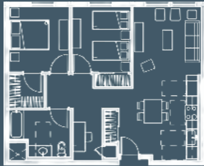
2 Bed/1 Bath, 820 sqft