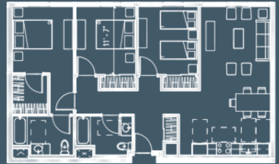
3 Bed/2 Bath, 1,110 sqft

Square footage is approximate and may vary by unit.