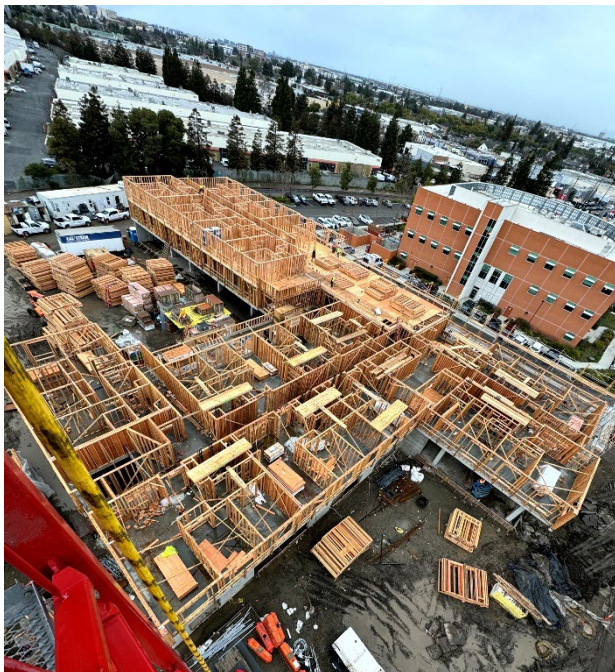
Figure 3 – Framing progress at northern building as of the second week of February 2024