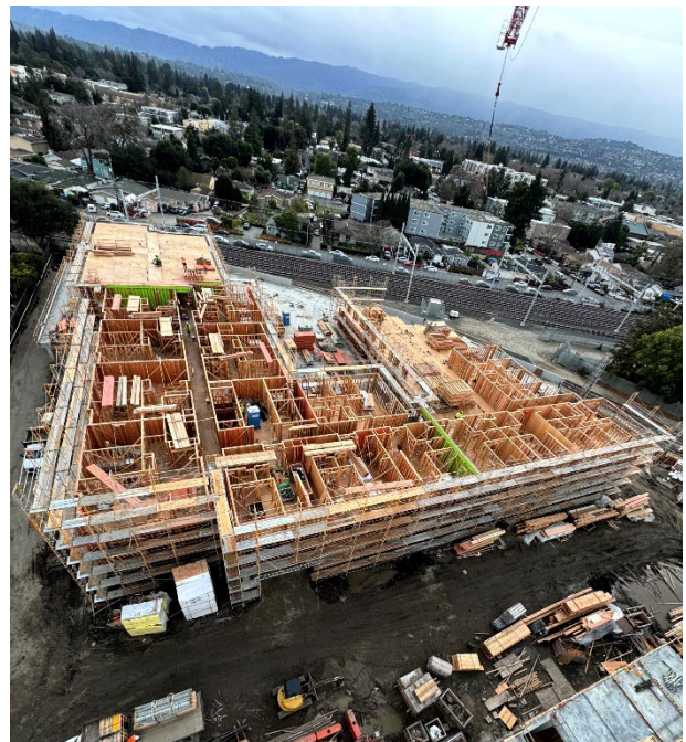
Figure 4 – Framing progress at southern building as of the second week of February 2024